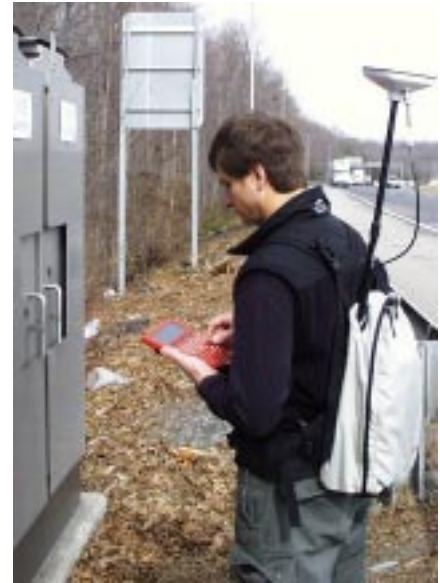
Virginia DOT used a Leica GS50 GPS/GIS unit to record highway signs, traffic cameras, and electrical service panels, along with many other pieces of equipment along state highways.