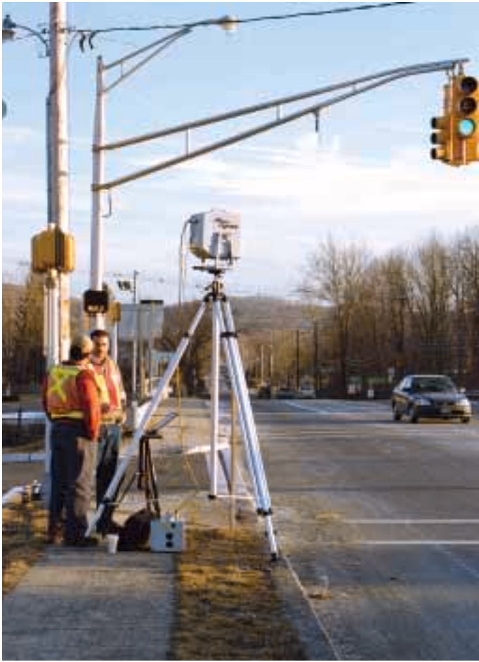
From the side of the roadway, Cyra ® 2500 laser scanner captures detailed road surface geometry