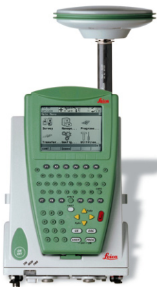
The new Leica GPS1200 series is proving to be popular with local users

integrity of the map data to continue their own effective operations.